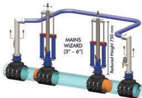
New Wizard Flow Stopping & Bypass Water System Launched at OzWater Show in Melbourne

Our son and daughter (both Directors) gave some support, but their commitments at the business meant this was limited.