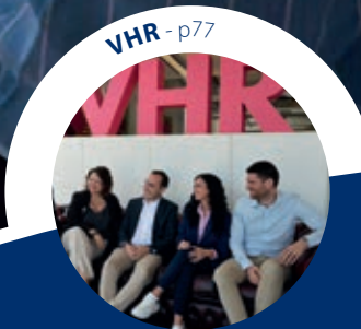
VHR - p77