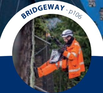
BRIDGEWAY - p106

Promoting Opportunity (Through Social Mobility)