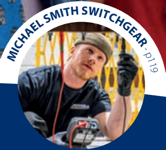
MICHAEL SMITH SWITCHGEAR - p119

Promoting Opportunity (Through Social Mobility)