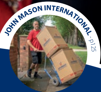
JOHN MASON INTERNATIONAL - p125