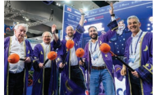
At OzWater Show '24 in Melbourne, Sarco wizards shocked & celebrating at news of King's Award success.

The King's Award highlights the company's enduring impact, trusted expertise, and vision for the future – rooted in tradition, driven by innovation and flying the flag for UK manufacturing and a global reputation for quality and reliable service.