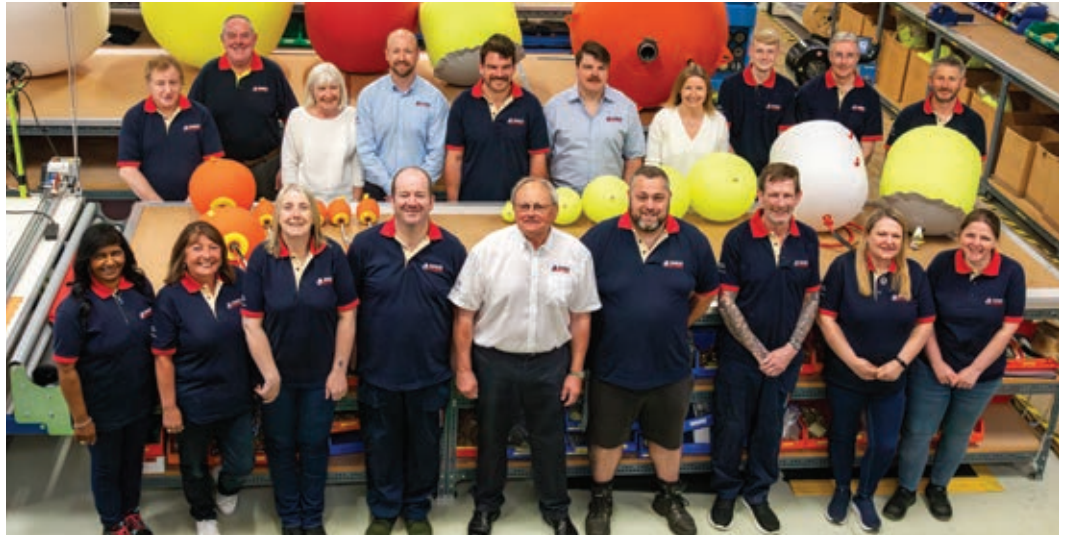
The Sarco team, proud winners of the King's Award for Enterprise 2024, in the innovation category

Sarco's Directors represent the fourth and fifth generations of local manufacturing in West Lothian.